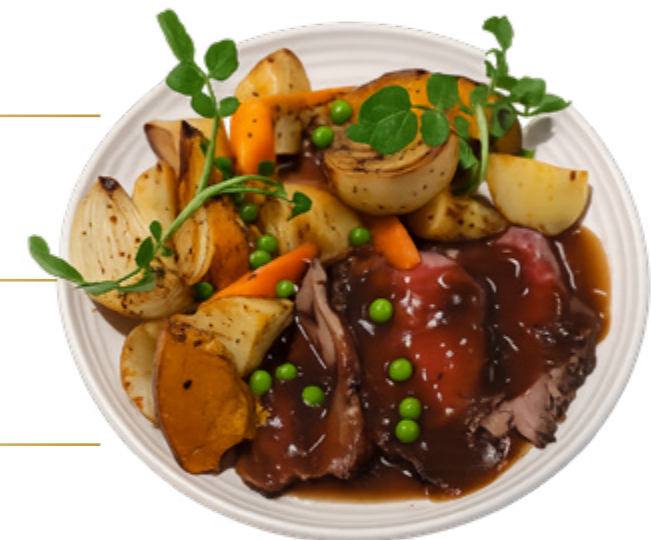
Lusso Bistro New $15 Winter Roast Page 18