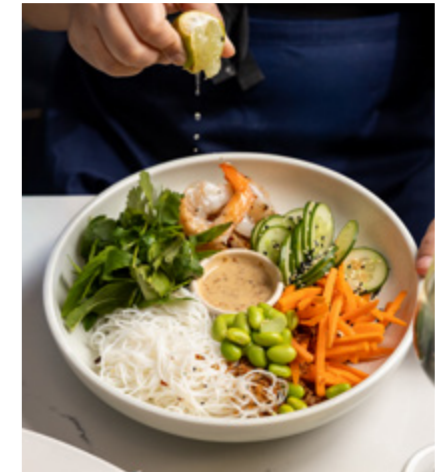
New Menu at Marlo's All Day Page 8